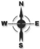
Sketch Floor Plan

Land Size _____ No. of Rooms _____ Construction - Roof _____ Walls _____ Water Pressure _____ No. of Bathrooms _____